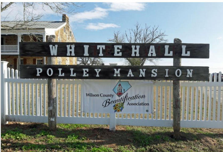
Wilson County Beautification Ceremony at Whitehall January 21, 2017