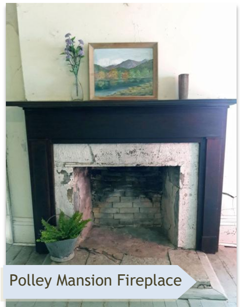
Polley Mansion Fireplace

We need your help! We want to include as many Polley descendents as would like to attend, but we need updated contact information to send them an invitation. So please pass along word of the reunion to your family members, and encourage them to sign up with the Polley Association!