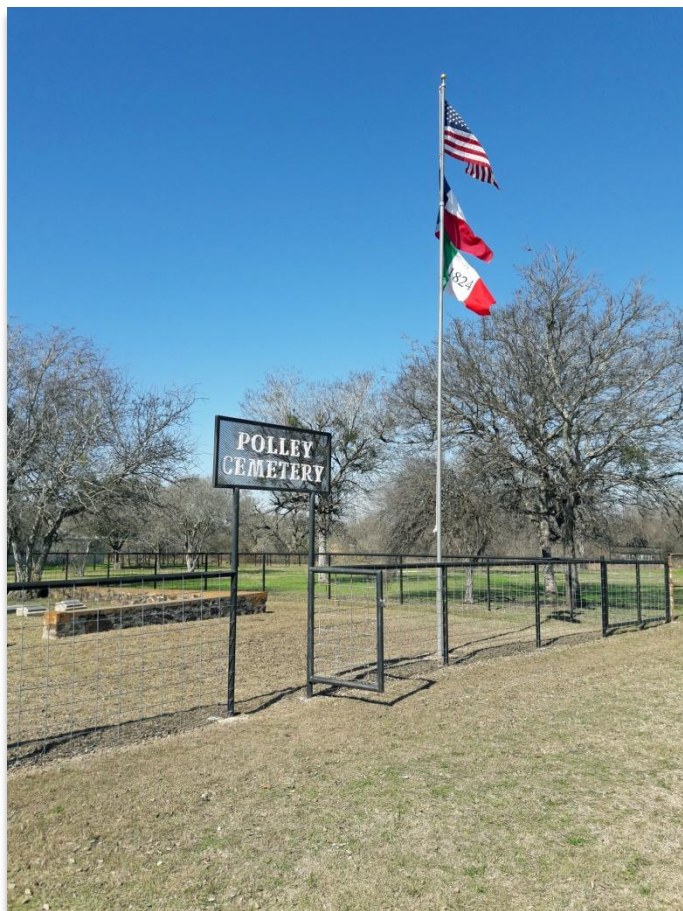
Polley Family Cemetery – January 2017 Flying the American, Texas Republic, and Mexican 1824 Flag for the Beautification Award ceremony.

If you know anyone who might be interested in the Polley family history, now is the time to invite them to join the Polley Association! We have exciting things planned on the horizon and it is a great time to be a part of this group.