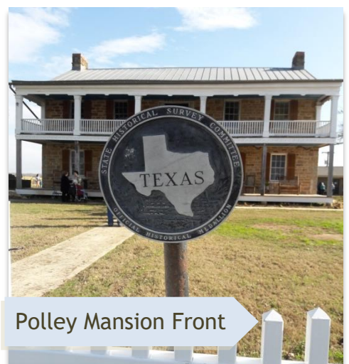
Polley Mansion Front