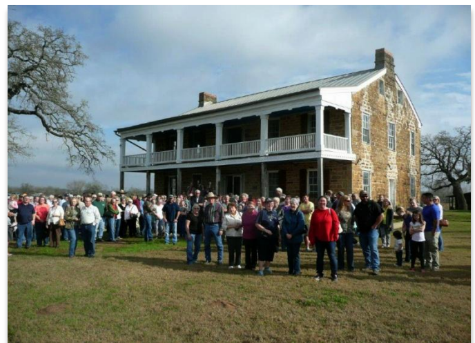
Photo of attendees at the Beautification Ceremony January 21, 2017