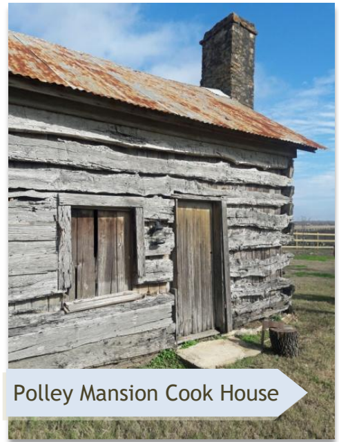
Polley Mansion Cook House